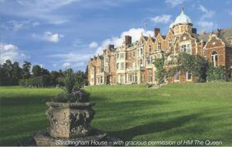
Sandringham House – with gracious permission of HM The Queen